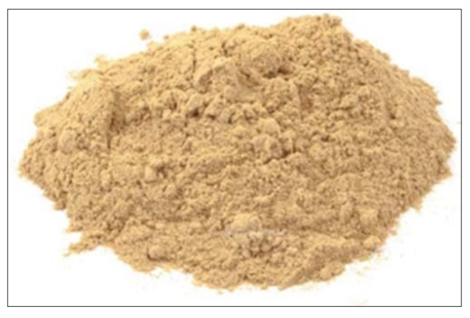
Fig. 5: Powder