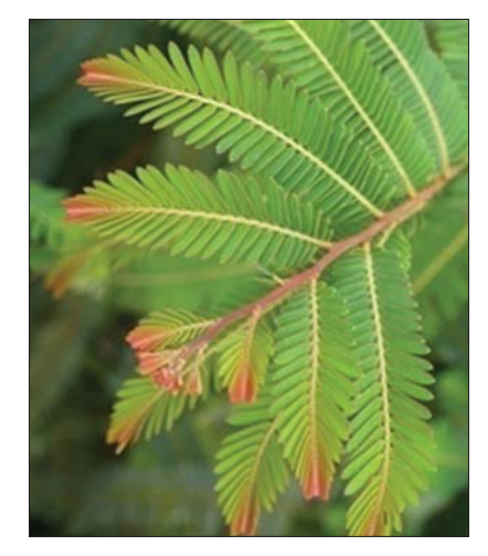
Fig. 6: Leaves