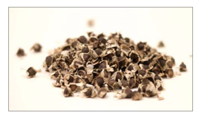
Fig. 7: Seeds

EO (amla) has been called the first-rate of the ayurvedic rejuvenating herb, considering by way of the usual stability of tastes (sweet, sour, pungent, bitter, and astringent) multifunction fruit and is well identified for its dietary characteristics. EO (amla) fruit is regularly the richest recognized normal source of vitamin C (200-900 mg per a hundred g of safe to eat component). The fruit juice involves close to 30 instances as so much nutrition C as orange juice, and a single fruit is the same as antiscorbutic value to at least one or two oranges. It also involves