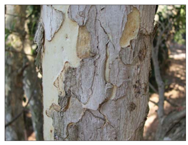
Fig. 1: Bark

It consists of fresh fruit pulp of EO (amla): (a) Macroscopic, (b) microscopic, (c) identity, purity, and strength, and (d) dose (Fig. 3) [14].