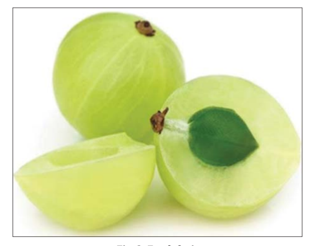
Fig. 3: Fresh fruit