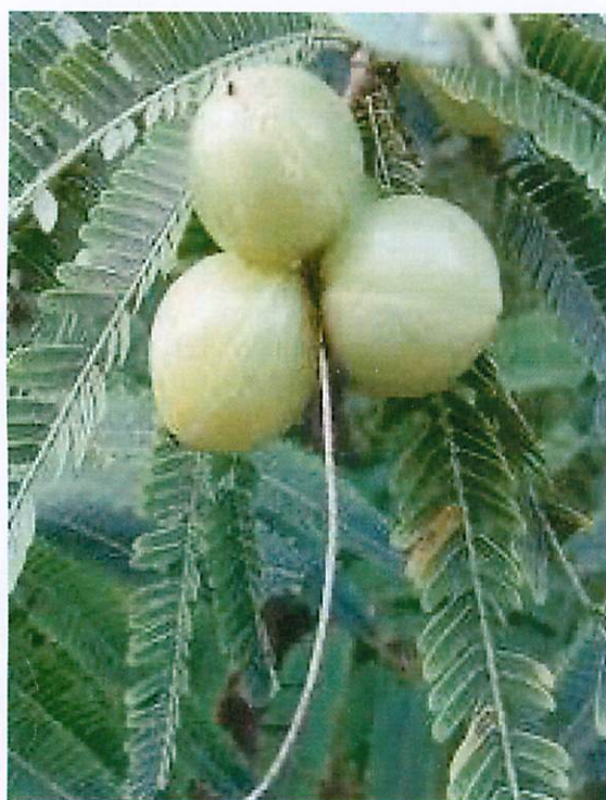
Fig 1: Amalaki fruit and leaves

Amalaki seed contains fixed oil, phosphatides and a small